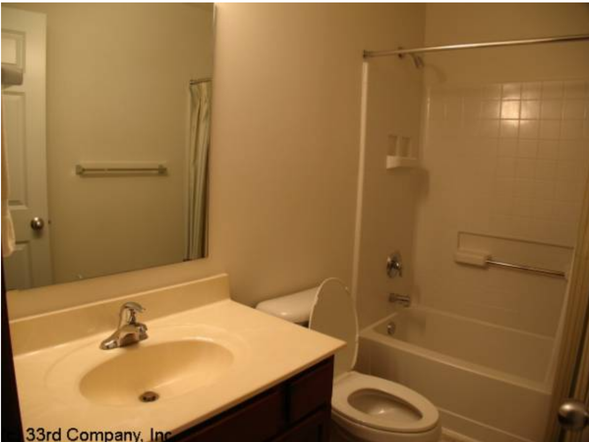
33rd Company, Inc.