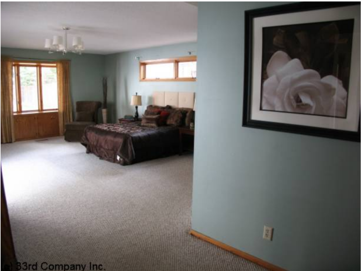
(a) 33rd Company Inc.