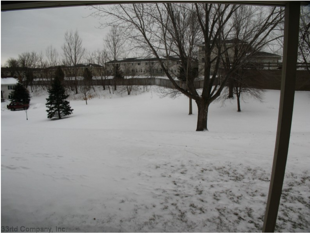
33rd Company, Inc.