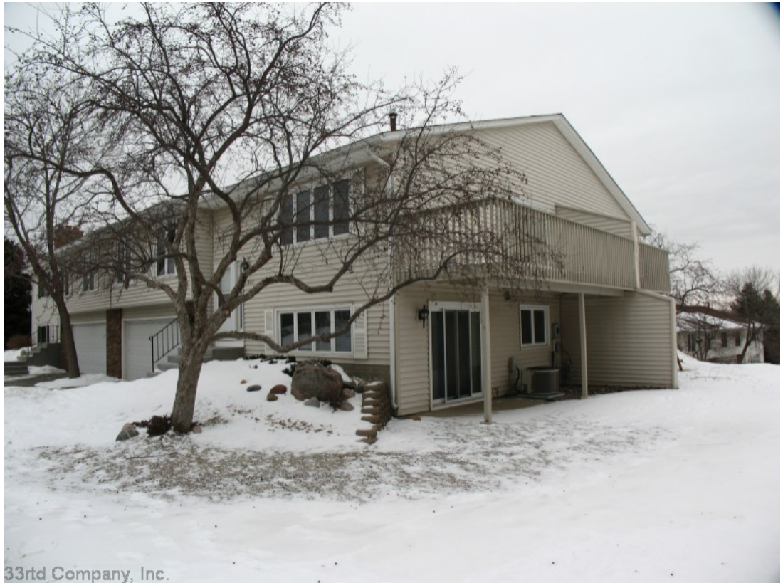
33rd Company, Inc.