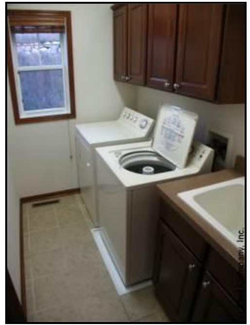
33rd Company, Inc.