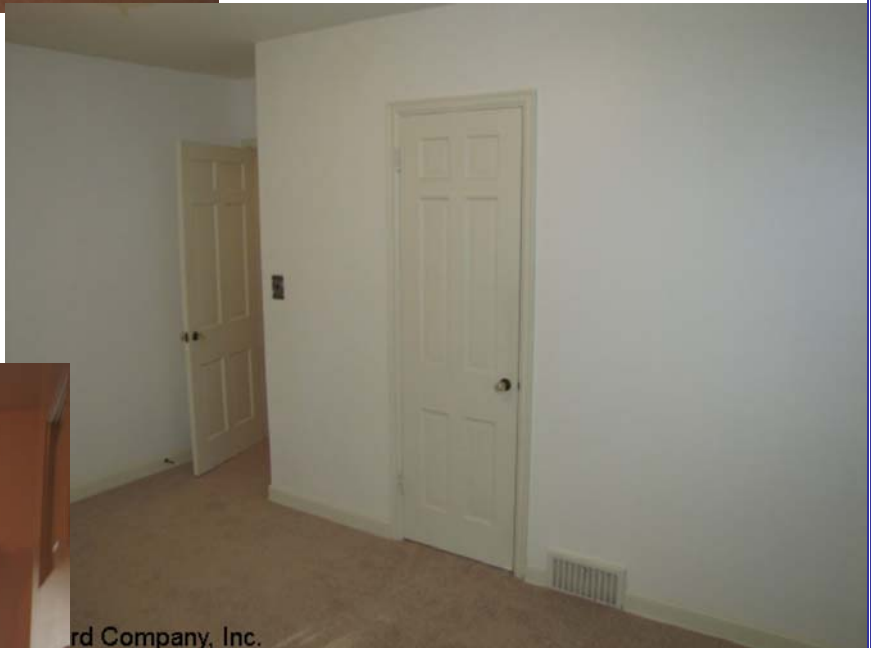
rd Company, Inc.