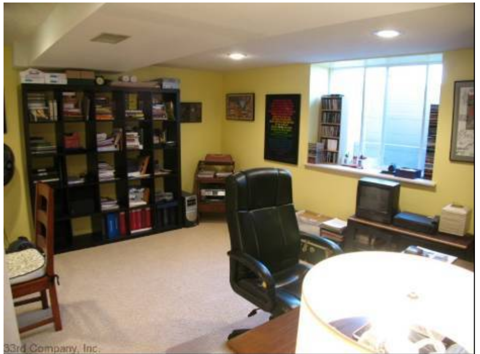
33rd Company, Inc.