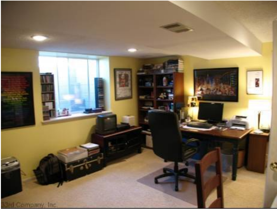
33rd Company, Inc.