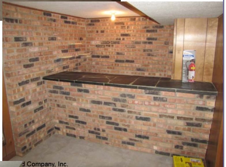
33rd Company, Inc.