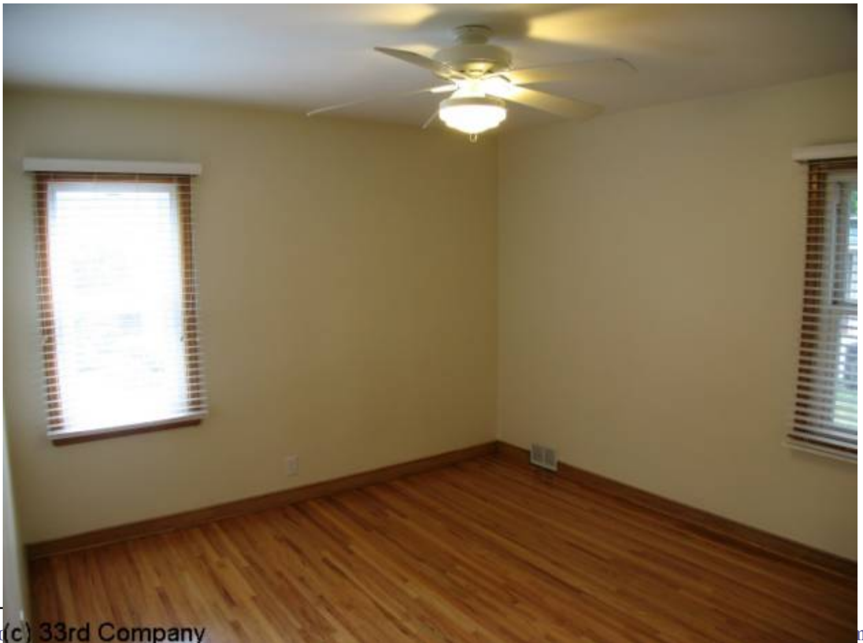
33rd Company