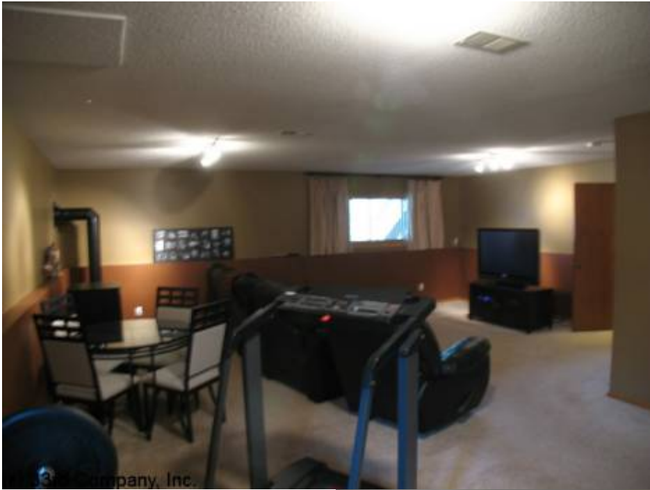
33rd Company, Inc.