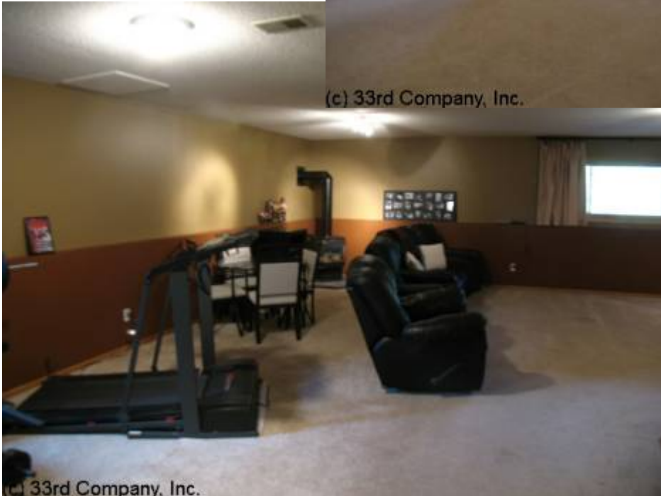
33rd Company, Inc.