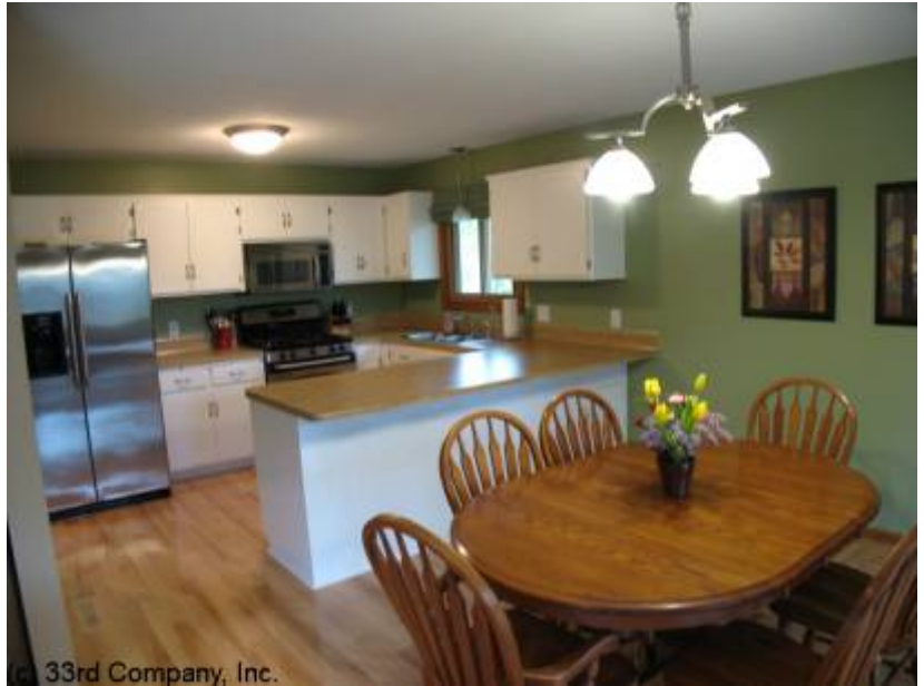
33rd Company, Inc.

Rental price $1495 per month Property type Single family home Year built 1983 Bedrooms 5 Baths 2 (1-Full, 1 ¾) Fireplace 1 (gas) Fence Partial Finished Sq. Ft. 2208 School District #11 Anoka/Hennepin 763-506-1000 Garage type 2 car Attached Pets Negotiable Smoking No Lease term 1 Year Security Deposit 1 Months Rent Appliances Stove, Refrigerator, Dishwasher, Microwave, Washer & Dryer, Water softener, Central A/C