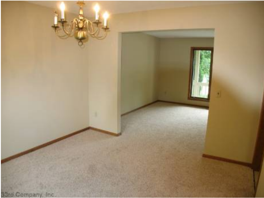
33rd Company, Inc.