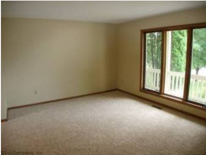
33rd Company, Inc.