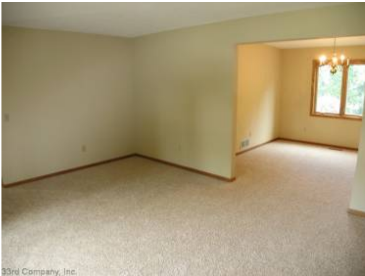
33rd Company, Inc.